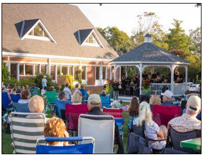
Osterville Public Library Social