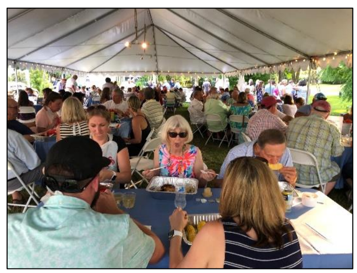
Osterville Public Library Social