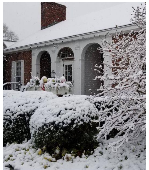
Centerville Public Library

Special services include on-going weekly and monthly programs, technical assistance, public computers, faxing, printing, photocopying, wireless access, digital literacy support, and homebound delivery. We engage our patrons through mailings of our Annual Report, quarterly newsletters, and ongoing publicity to newspapers, radio stations, email, and popular social media platforms. We also provide meeting space and outreach to local organizations and town officials.