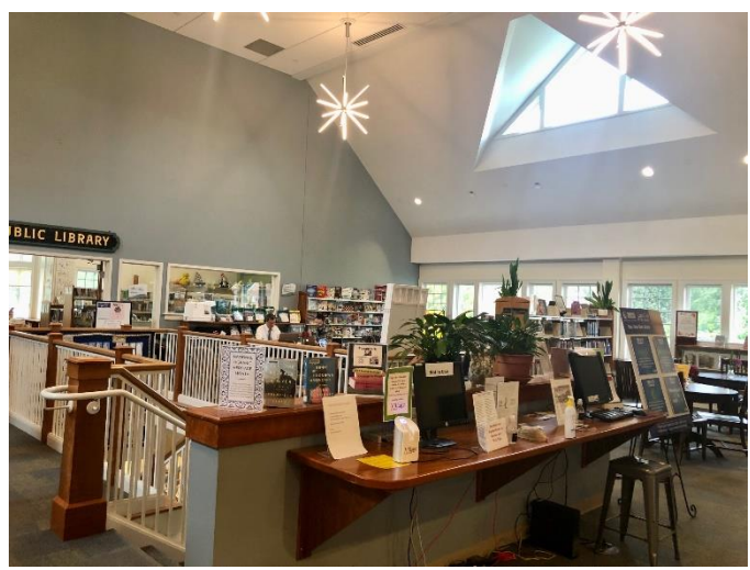
Osterville Public Library