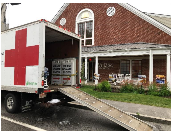
Osterville Library hosting monthly blood drives