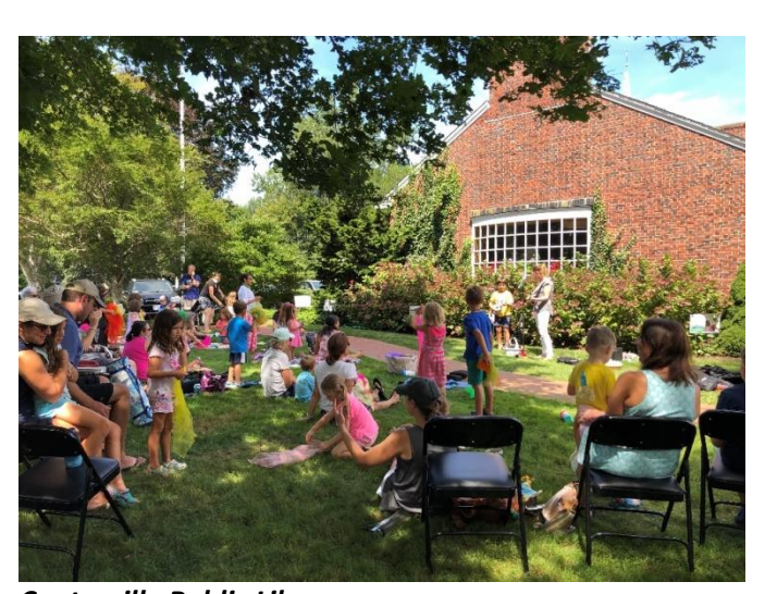
Centerville Public Library